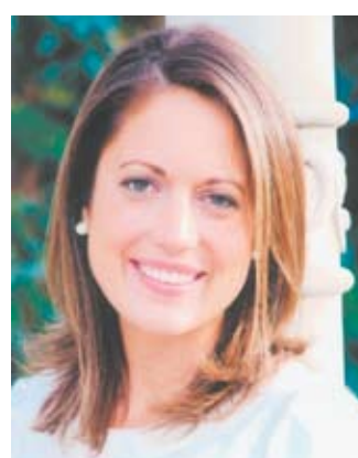
HULSEWEDE & GILLENWATER

H $216 Photo: 3.5" x 4.3" Words: 150 approx. (860 characters)