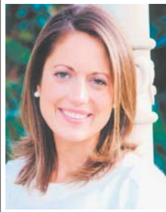
HULSEWEDE & GILLENWATER

K $288 Photo: 3.5" x 4.3" Words: 290 approx. (1700 characters)