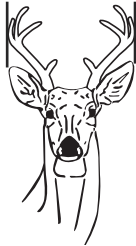
12" Inside Spread